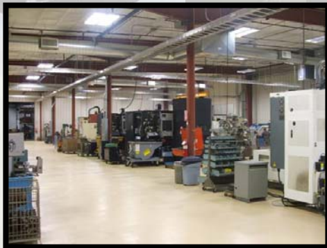
State of the art facilities