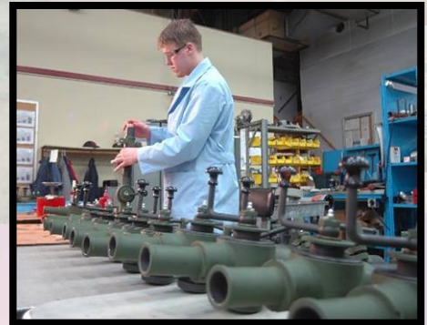
Program & Project Management